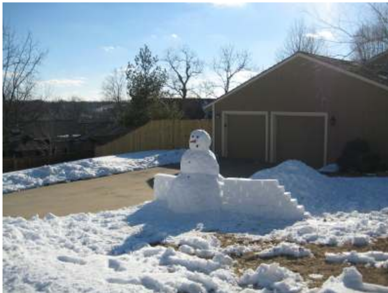
Chloe Shamhart's snowman surveys the neighborhood.

Cream butter, shortening and sugar, add water and vanilla, and mix well. Add flour, baking soda and baking powder, and mix well. Stir in sunflower seeds. Roll in balls (whatever size you want) and flatten with glass dipped in sugar. Bake at 350 degrees on ungreased cookie sheets for 13-14 minutes.